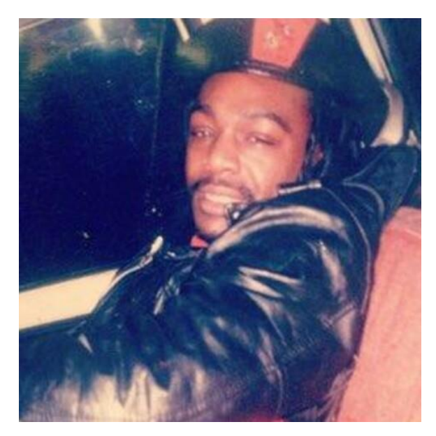
To offer condolences to The Johnson Family, visit www.TheChapelofPeace.com

Good people pass away; the godly often die before their time. But no one seems to care or wonder why. No one seems to understand that God is protecting them from the evil to come. For those who follow godly paths will rest in peace when they die. Isaiah 57:1-2