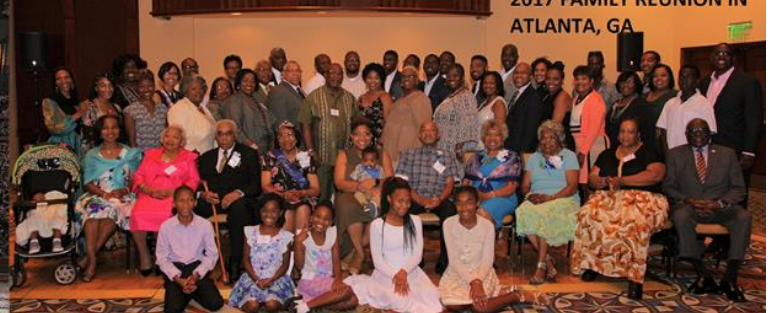
2017 FAMILY REUNION IN ATLANTA, GA