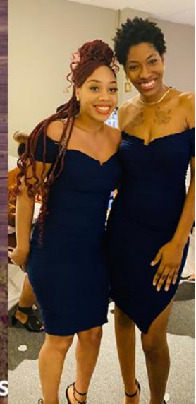
Grandchildren and Greats