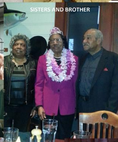
SISTERS AND BROTHER