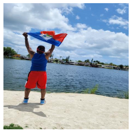
To offer condolences to The Desir Family, visit www.TheChapelofPeace.com

Forest Lawn Memorial Gardens 5600 East Broad Street Columbus, Ohio 43232